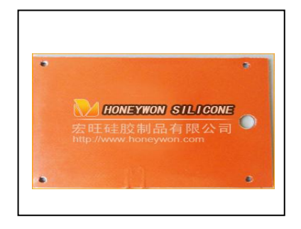
3D printers silicone hotbed with holes for fixing

Abnormal shape Silicone rubber pad heaters for cone