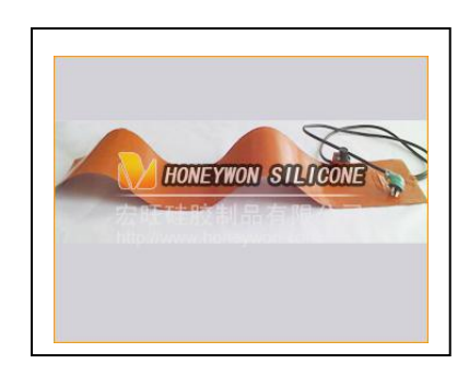
Flexible Silicone Rubber heating belt strip strap heaters