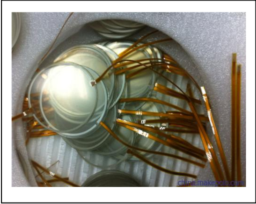
Round Circular Transparent Heaters