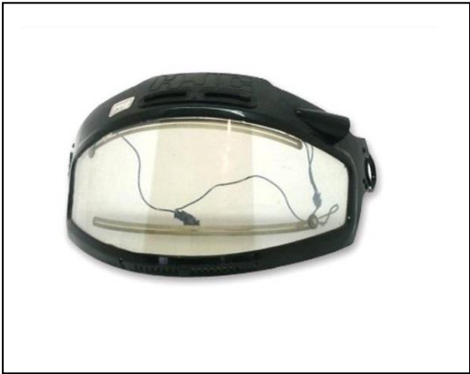
Transparent Helmet Film Heaters