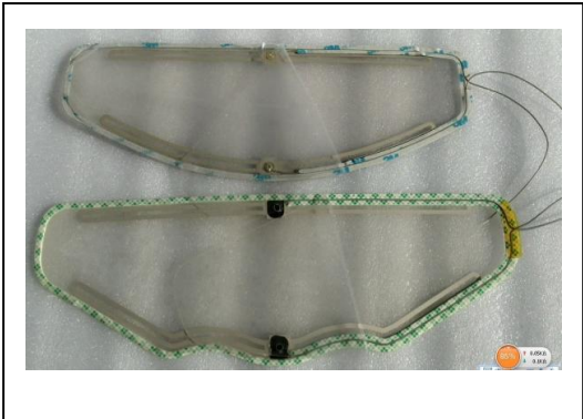
Transparent Membrane Heaters