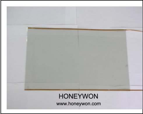
Transparent Film Heaters Transparent Heating Membrane