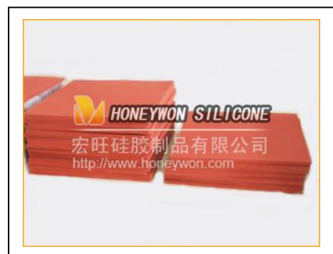
Silicone rubber foam pad