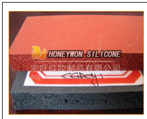
Silicone rubber sponge sheets