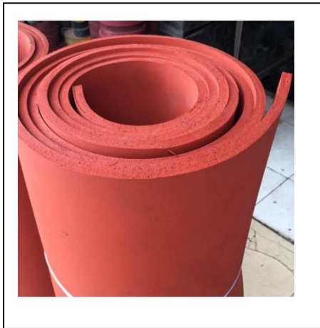
Silicone rubber sponge roll