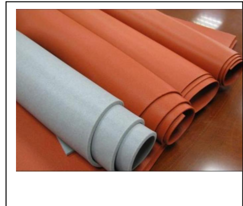
silicone rubber foam roll