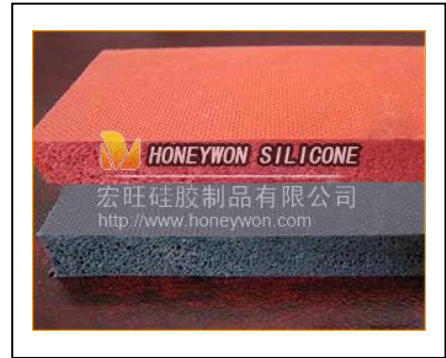
silicone rubber foam sheets mats