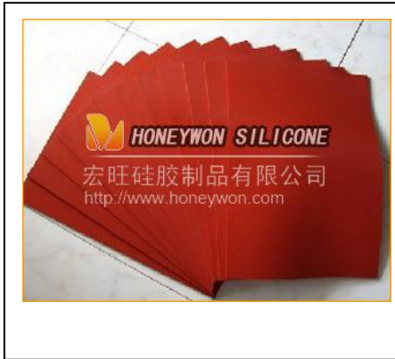
Silicone rubber sponge mats pads